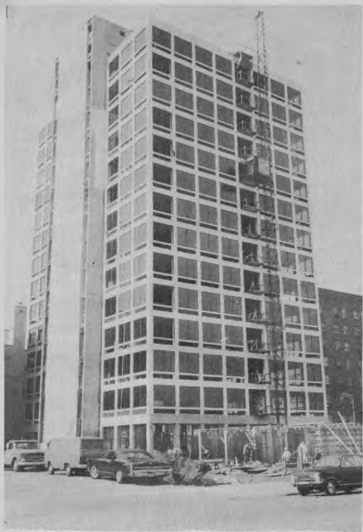
EXPANDING into the outer realms of a previously static skyline looms the 16-story St. Joseph Bank Building.