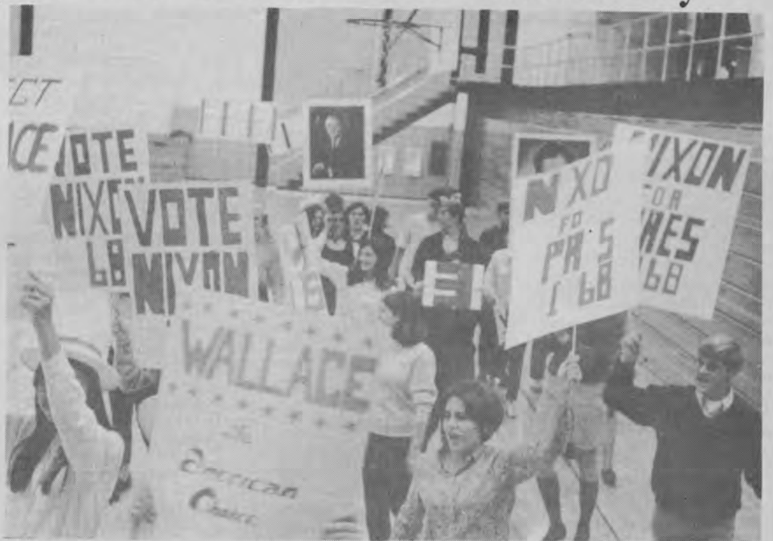
WALLACE, NIXON, OR HUMPHREY? National Honor Society Members parade around the gym in rehearsal for the mock election.