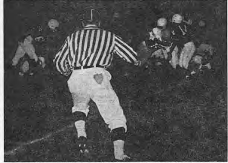
THE REFEREE closes in on the action in Jackson's first Valley Conference football game against Penn Sept. 9.